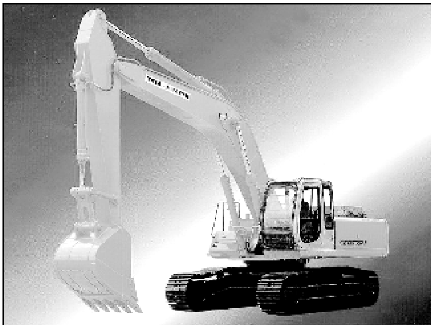
Tata-Hitachi EX350 LCH-V