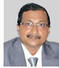
Dr M. M. Murudi Sardar Patel College of Engineering, Mumbai, India