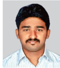
Dr Sharan Kumar Goudar College of Engineering, Pune, India