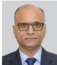
Dr S. K. Madan National Institute of Information Technology (NIIT) Kurukshetra, India