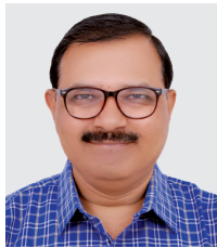
Dr K. A. Patil Government Engineering College Pune, India