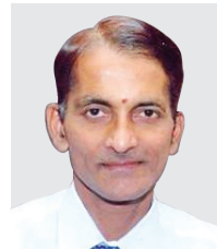
Dr K. B. Prakash Government Engineering College, Haveri, India