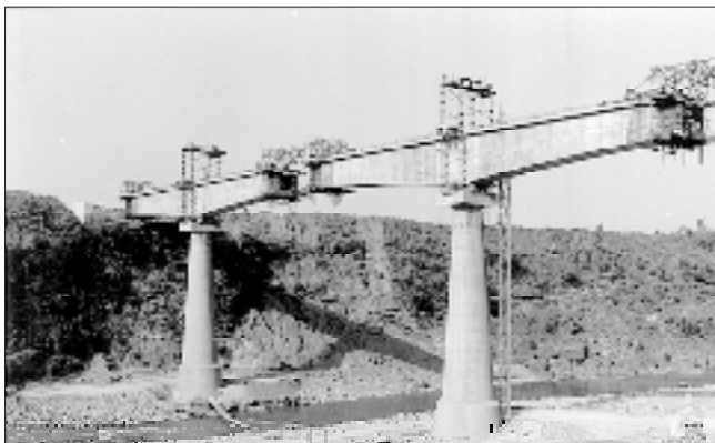
The Jammu-Udhampur Rail Link project

The company has a team of specially trained applicators who can execute large application jobs, trained engineers and sales staff to oversee the execution of the work. There is close association with the consultants and the clients right at the specification stage to offer product support and advice. The supply chain consists of a countrywide network of stockists.